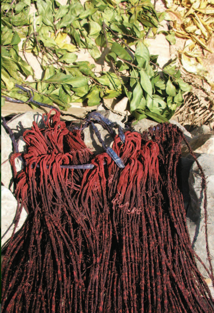
ABOVE: Morinda-dyed threads with Symplocos leaves used in the mordant process.